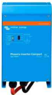
Inverter Compact 24/1600

The possibilities of paralleled high power inverters are truly amazing. For ideas, examples and battery capacity calculations please refer to our book 'Energy Unlimited' (available free of charge from Victron Energy and downloadable from www.victronenergy.com ).