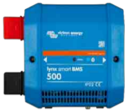
Lynx Smart BMS 500 A