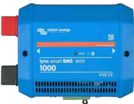
Lynx Smart BMS 1000 A